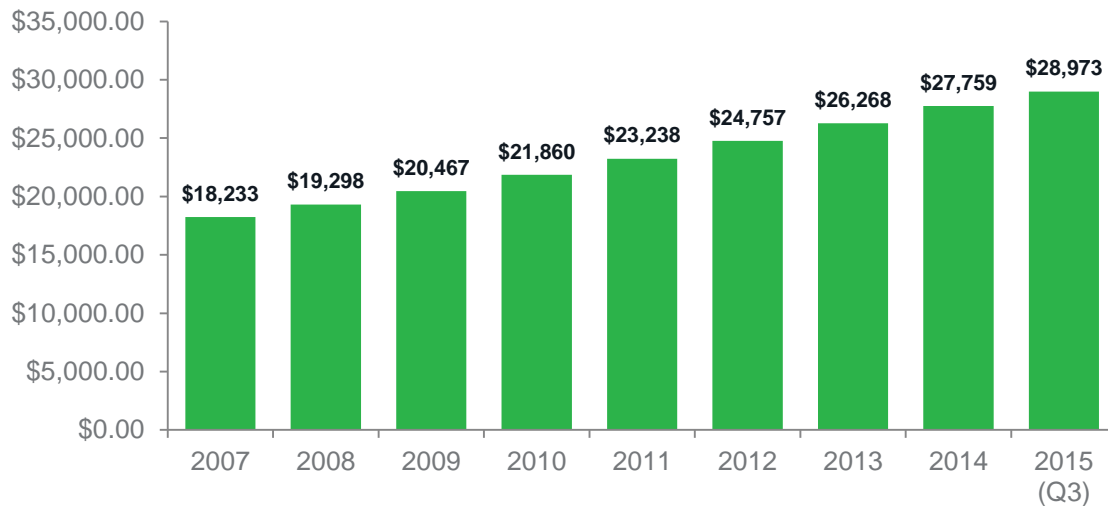
FIGURE 1: AVERAGE BALANCE PER BORROWER (FEDERAL STUDENT LOANS) 7

Unlike other types of consumer debt, which have realized reduced levels of delinquency and default compared to highs reached following the Great Recession, the student loan market continues to show signs of distress. 8 The Bureau estimates that a quarter of student loan borrowers are, collectively, either delinquent or in default on more than $175 billion in student debt. 9 Borrowers with certain characteristics, including borrowers who attend proprietary schools and borrowers who do not successfully complete a program of study, comprise an