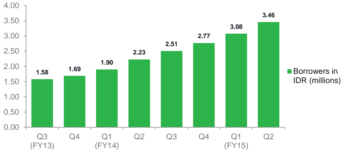
FIGURE 3: INCOME-DRIVEN REPAYMENT PLAN UTILIZATION OVER TIME (DIRECT LOANS) 52

The following discussion highlights specific servicing practices related to enrolling in alternative repayment plans, as identified in public comments and other input received by the Bureau.